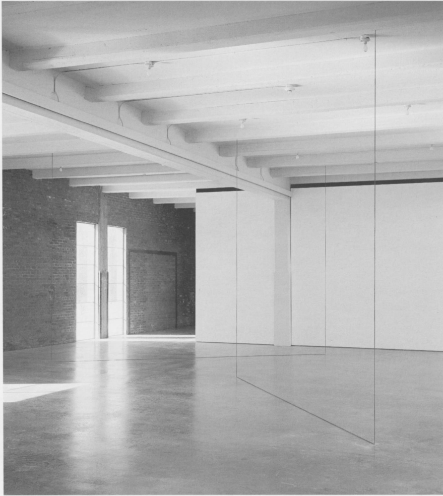
Fred Sandback. Untitled (from Ten Vertical Constructions ), 1977. Two-part vertical construction, red (variation). Installation view at Dia:Beacon, Riggio Galleries.

work so simply, to do so little, to restrict oneself to such modest means and such a limited formal vocabulary, over such a long period of time, is itself a kind of disappearance. For me, what makes Sandback's work so moving is not that he did so much with so little, but that he did so little.