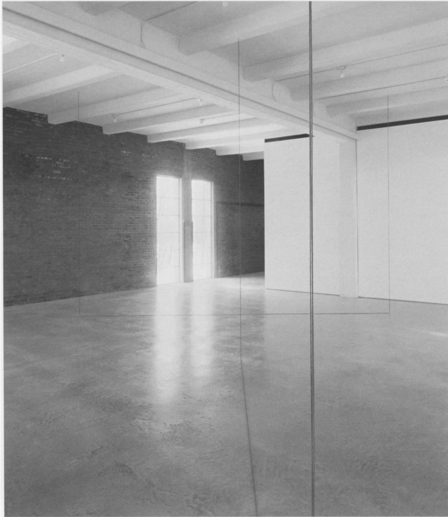
Fred Sandback. Untitled (from Ten Vertical Constructions) , 1977. Two-part vertical construction, red (variation). Installation view at Dia:Beacon, Riggio Galleries.

and thus come to function as “cultural capital,” existing as products “of domination predisposed to express or legitimate domination.” In societies with little or no class differentiation, on the other hand,